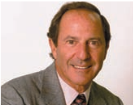
MORTIMER B. ZUCKERMAN