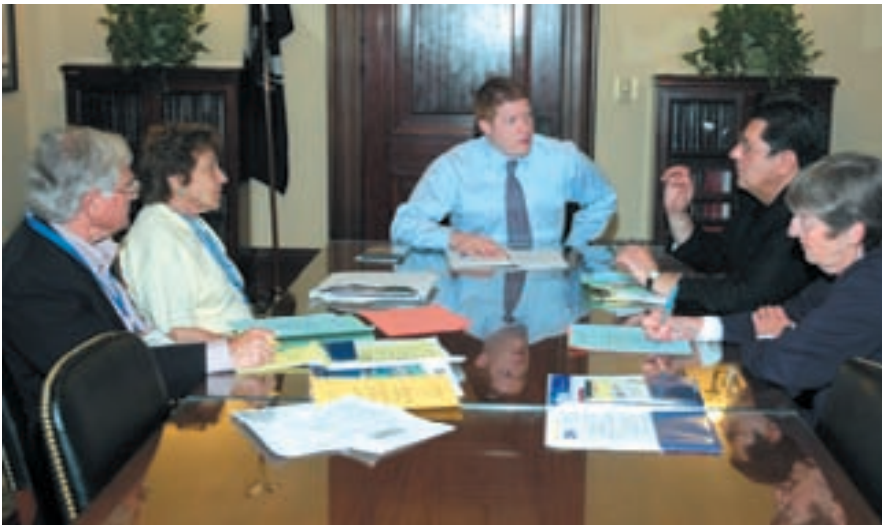
A typical lobbying session; leaders of Michigan ZOA delegation meet with a Congressional aide.