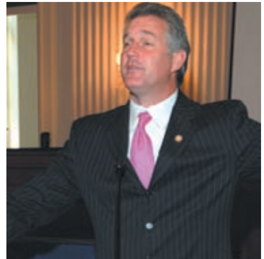
Representative Rick Renzi (R-AZ).