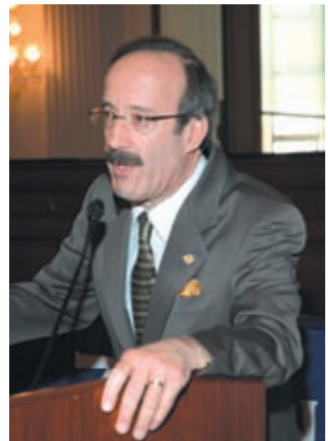
Representative Eliot Engel (D-NY).