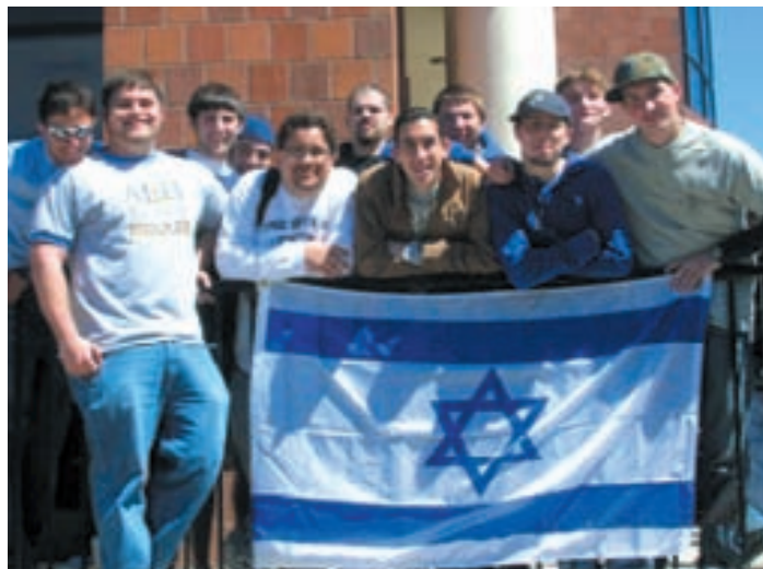
Virginia Commonwealth University Students for Israel.

ZOA CAN's "Make a Video for a Soldier" video-taped Jewish students' messages of support, which were then edited into a short film to be screened for Israel Defense Force soldiers as a morale booster. The program visited Rutgers University, NYU, Queens College, and UCLA.