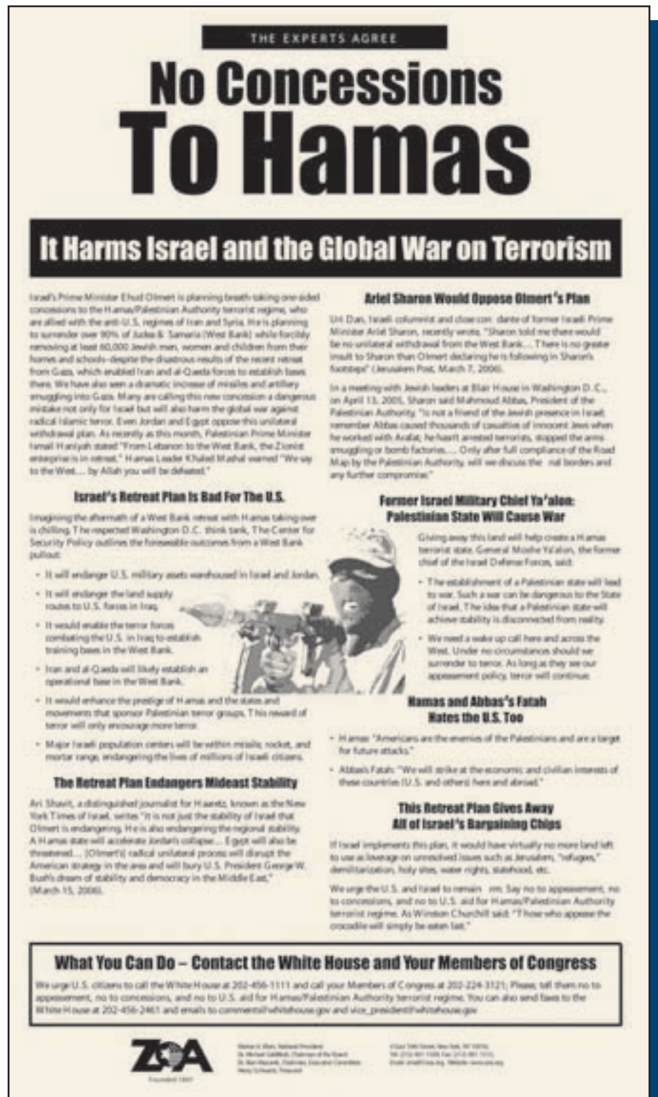
ZOA's full-page newspaper ad appeared during Prime Minister Olmert's visit to Washington DC.

“Iran is seeking a nuclear capability, the Iranian military project – there is no doubt of their intention and determination – and this must be stopped.”