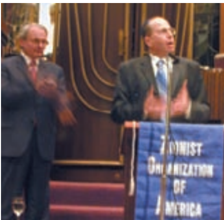
General Ya'alon addressing full house at New York's Lincoln Square Synagogue.

These comments were all the more powerful coming from a 37-year military veteran who originally supported Rabin's Oslo accords. But he said that by 1995, he saw that Arafat was not doing anything to move toward peace, but instead was promoting "Jihad."