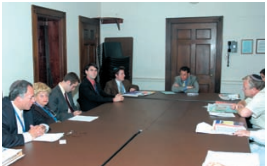
ZOA lobbyists meet with Representative Anthony D. Weiner (D-NY).