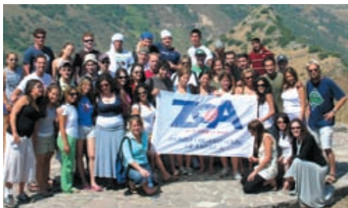
Visiting Gamla in the Golan Heights in northern Israel.