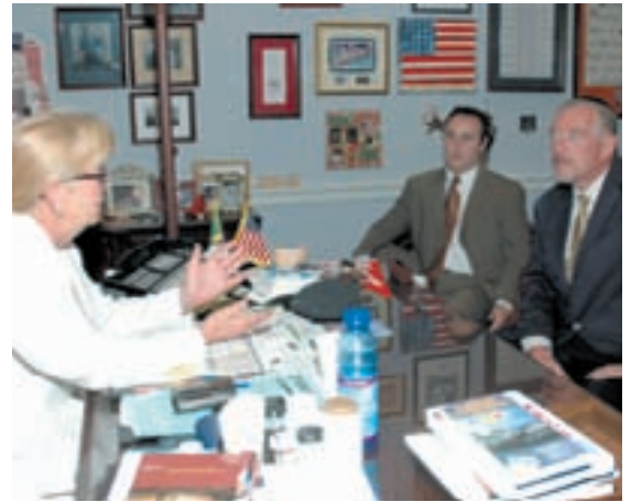
Carolyn McCarthy (D-NY) meets with two ZOA delegates.