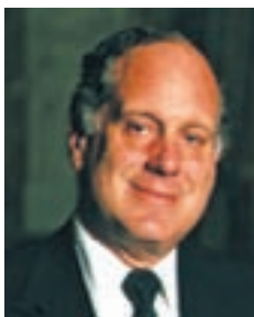
RONALD S. LAUDER