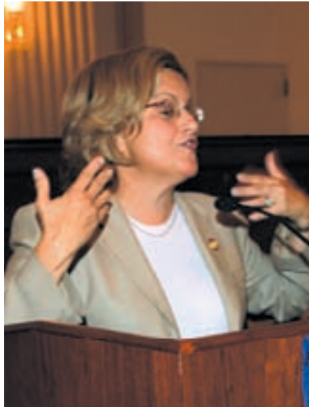
Representative Ileana Ros-Lehtinen (R-FL), Chairwoman, House Subcommittee on the Middle East.