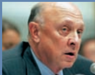
R. JAMES WOOLSEY

FORMER CHAIRMEN, CONFERENCE OF PRESIDENTS OF MAJOR AMERICAN JEWISH ORGANIZATIONS / DISTINGUISHED BUSINESSMEN