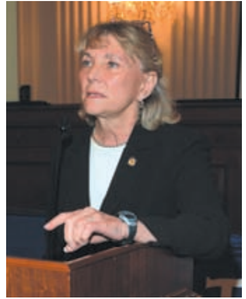
Representative Sue Kelly (R-NY).