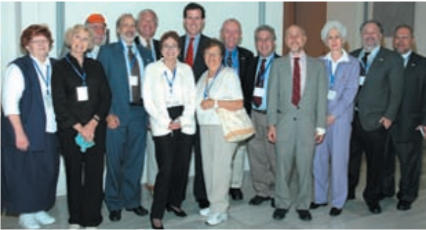
Philadelphia District's ZOA contingent, with Pennsylvania Senator Rick Santorum (R-PA), center.