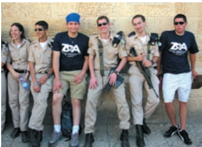
ZOA/Mayanot Birthright Israel participants with soldiers from the Israeli Navy.