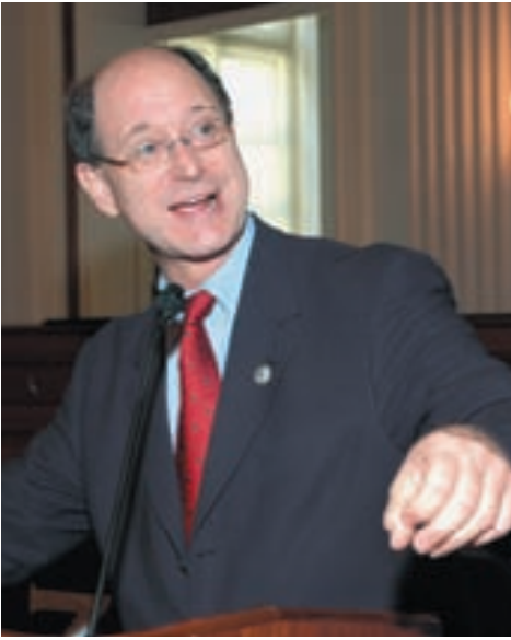
Representative Brad Sherman (D-CA).