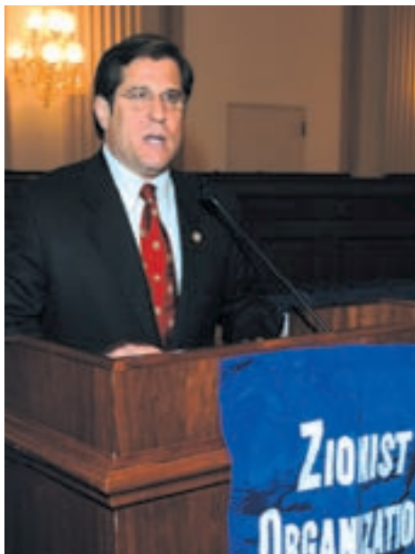
Representative Steven R. Rothman (D-NJ).