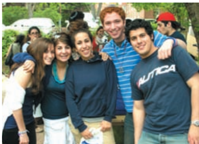
Rutgers University students at Yom Ha'atzmaut party.