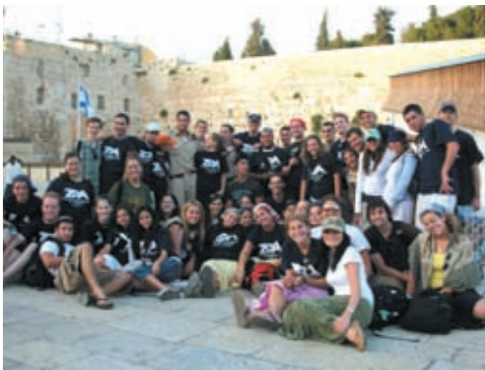
Students from the ZOA trip in front of the Western Wall in Jerusalem's Old City.