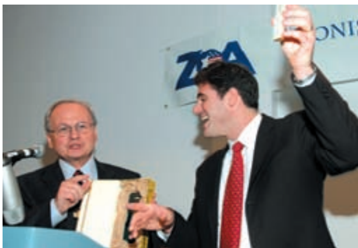
Presentation of a gift to Israel Embassy's Minister of Economic Affairs Ron Dermer by ZOA President Morton A. Klein.

Trent Franks (R-AZ) said that America must help Israel defend itself and that "the peace of the world is intrinsically connected to the peace of Jerusalem."