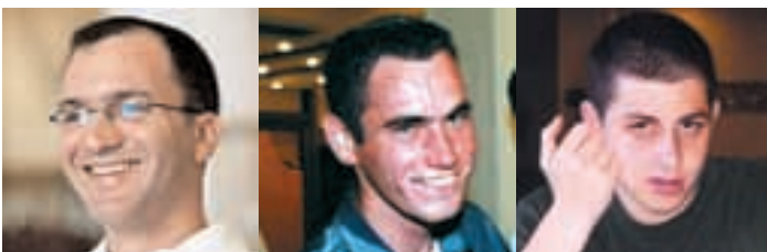
EHUD GOLDWASSER ELADAD REGEV GILAD SHALIT

ZOA CAN organized a campaign to send 10,000 postcards to both the United Nations and the International Red Cross. These postcards, which included photos of captured Israeli soldiers Gilad Shalit, Ehud Goldwasser, and Eldad Regev, urged the UN and the International Red Cross to do everything in their power to achieve the safe return of these soldiers. Students on campuses nationwide are participating in this campaign by distributing and mailing these postcards to the UN and the Red Cross. To get copies of the postcards, email campus@zoa.org .