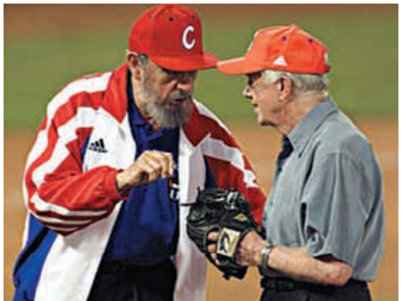
CARTER THROWS A CURVE BALL

A MEETING OF THE MINDS: FIDEL CASTRO & JIMMY CARTER