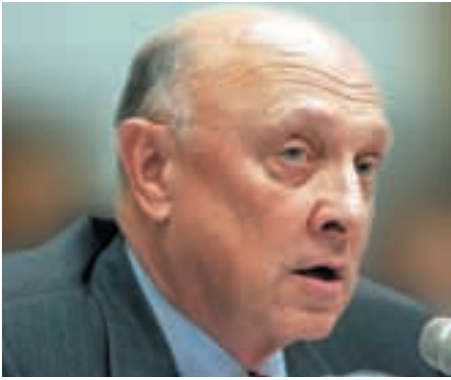
R. JAMES WOOLSEY, FORMER CIA DIRECTOR