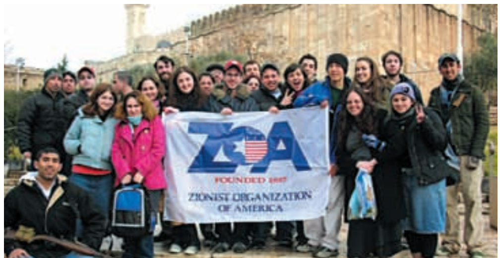
STUDENTS ON THE ZOA LEADERSHIP MISSION TO ISRAEL TRAVEL TO HEVRON