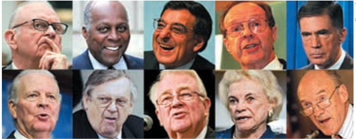
THE IRAQ STUDY GROUP: (TOP ROW, FROM LEFT) DEMOCRATS LEE HAMILTON, VERNON JORDAN, LEON PANETTA, WILLIAM PERRY AND CHARLES ROBB; (BOTTOM ROW, FROM LEFT) REPUBLICANS JAMES BAKER, LAWRENCE EAGLEBURGER, EDWIN MEESE, SANDRA DAY O'CONNOR AND ALAN SIMPSON

T he report issued by the Iraq Study Group, headed by former secretary of state James Baker and former congressman Lee Hamilton, urges President Bush to adopt policies that amount to ignoring 13 years of Palestinian terrorism, incitement to hatred and murder of Israelis by the Palestinian Authority (PA) and failed concessionary Israeli policies, while at the same time calling for even more Israeli concessions to the Hamas/PA regime.