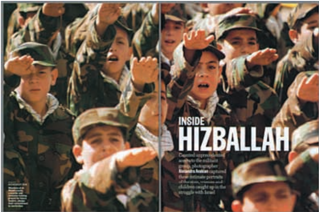
TIME Magazine, July 31, 2006

It's the one thing that Hizballah, Hamas, Fatah and their sponsor Muslim regimes have in common: an ideology that preaches a genocidal war against the Jews. The Arab indoctrination of its youth to hatred – in preschools, classrooms, summer camps and throughout the media – has shaped the current Arab war against Israel. No less, this glorification of jihad, death, and martyrdom defines and determines the future war against the Jews. ZOA fights to make certain that it is a war that must not be ignored.