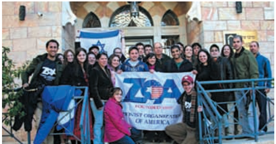
THE ZOA STUDENT LEADERSHIP MISSION TO ISRAEL MEETS FORMER IDF CHIEF-OF-STAFF MOSHE YAALON AT THE SHALEM CENTER