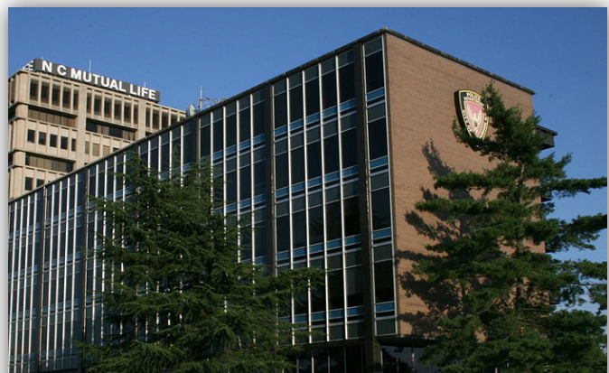
Durham, NC Police Department

The Voice for Israel and Jewish Federation leaders urged the Human Relations Commission to (1) provide a public forum for airing complaints about the City Council's statement; (2) obtain the data to determine whether the City Council's statement is supported by the facts and meets the needs of the city; (3) recommend that the City Council rescind its statement, if the evidence shows that the statement was unfair, unwarranted and discriminatory, and created unnecessary tensions and divides within the Durham community; and (4) caution the City Council to make future determinations based on unbiased evidence, not hateful propaganda. We await the Human Relations Commission's response.