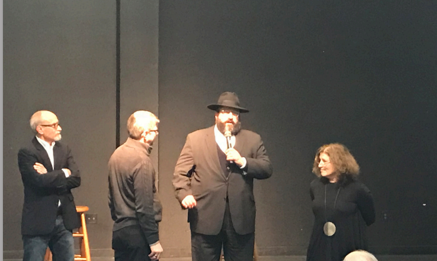
Q&A at the ZOA West Coast screening of The Fight Of Our Lives

ZOA's director and lay leadership to active members from both counties.