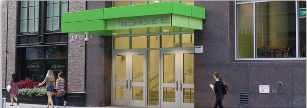
The Beacon School in Manhattan

The Beacon School, an elite New York City public high school, rarely if ever holds silent tributes. It's never mourned the deaths of the estimated 500,000 Syrians killed by President Bashar al-Assad's government and its allies, or the murders of 2,000 Israelis over the last two decades.