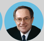
Prof. Alan Dershowitz