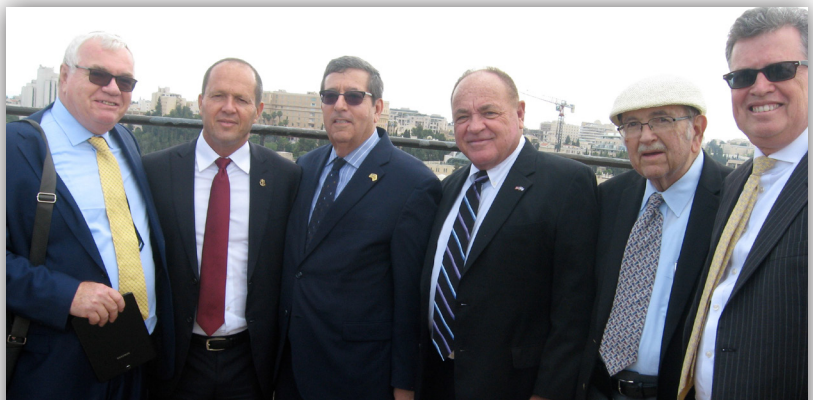
ZOA leaders with Mayor of Jerusalem Nir Barkat (second from left)

"I prayed and prayed for this day, but I did not think I would live to see it actually happen in my lifetime."