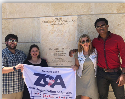
ZOA Campus Staff at the new US Embassy in Jerusalem