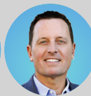
Amb. Richard Grenell