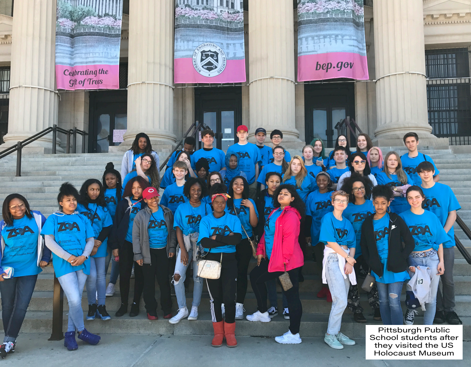
Pittsburgh Public School students after they visited the US Holocaust Museum