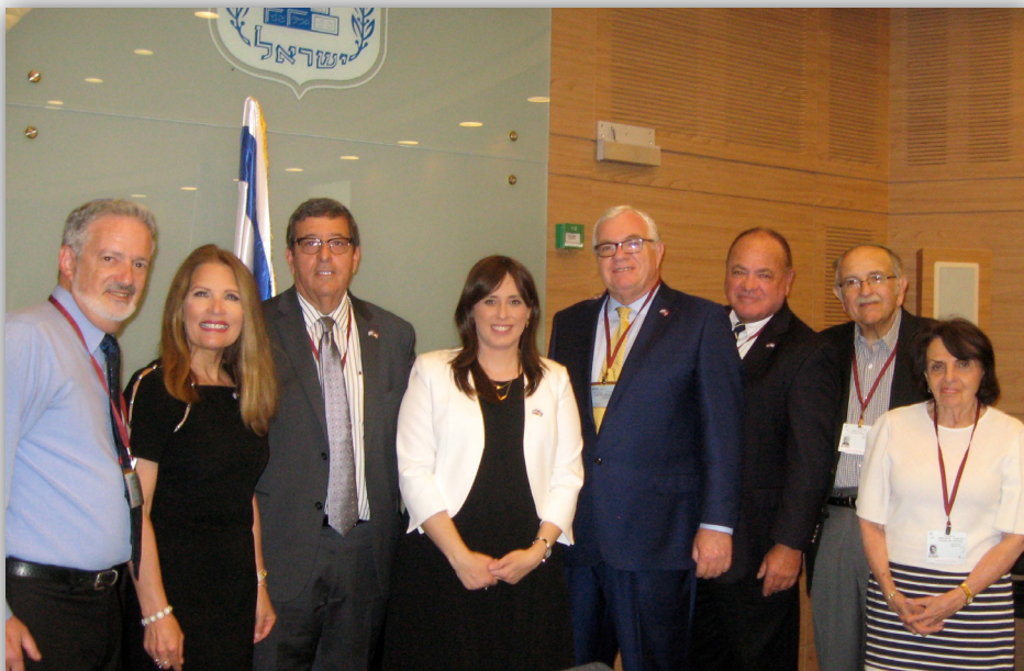
ZOA delegation members and former Cong. Michele Bachmann treated to briefing by Dep. Min. Tzipi Hotovely at the Knesset

As for the US embassy move, we have yet to assess its full significance. ZOA Israel is advising diplomats from across the globe that they would be well advised to follow America's lead. Only one other Jerusalem building would be able to top the new embassy in historical importance, we tell them, and when that building on the Temple Mount goes up — God willing — real estate prices in this city will go through the roof!