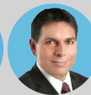
Amb. Danny Danon