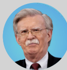
Amb. John Bolton