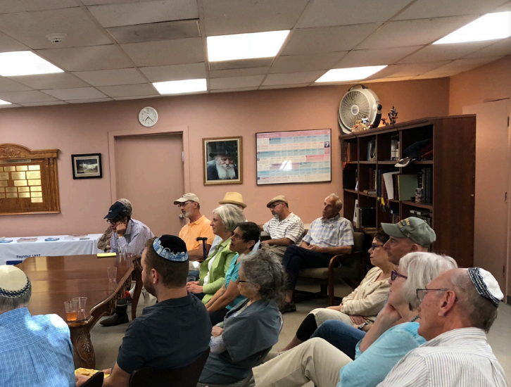
sents his research on UNRWA in Santa Rosa, CA