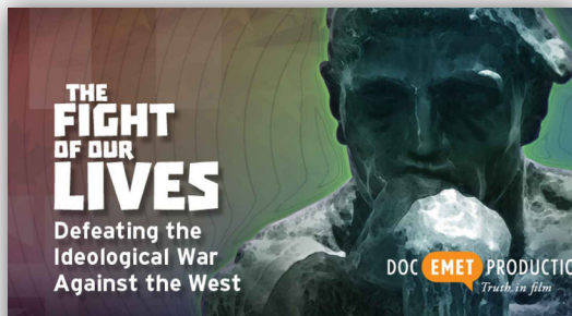
ZOA Michigant event flyer featuring the film, The Fight Of Our Lives

ZOA op-eds that focused on the Iran deal, the Israeli-Palestinian Arab conflict, the future of American Jewry, anti-Semitism at universities, and BDS, were published in local and national media, including the Detroit Jewish News , Times of Israel , and the Jerusalem Post . We reached thousands of people and educated them on current events.