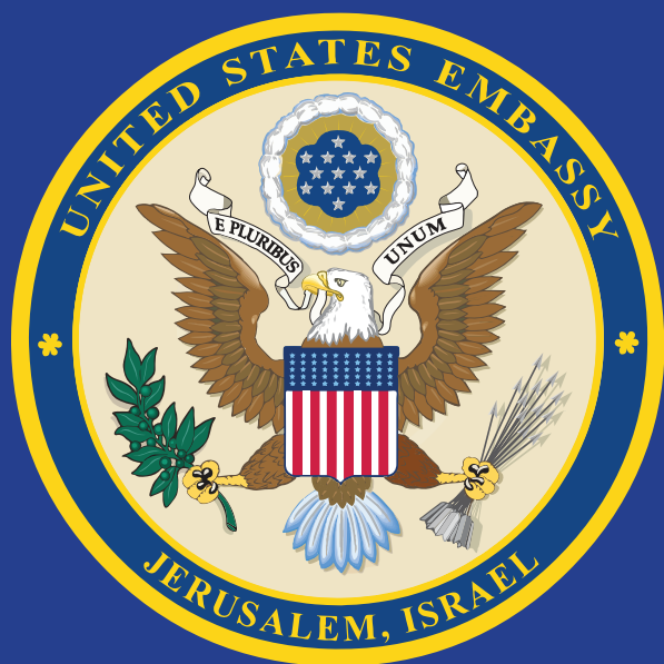
Official Embassy Seal

CELEBRATING 70 TH ANNIVERSARY OF REESTABLISHMENT OF ISRAEL AND OPENING OF US EMBASSY IN JERUSALEM