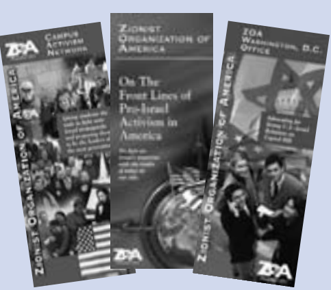
New ZOA Programmatic Brochures