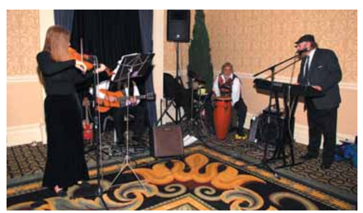
Shoresh Orchestra supplied live music

Next, Klein explained the dangers for Israel contained in the so-called Arab Peace Initiative, first proposed by Saudi Arabia in 2002. He observed that (Continued on page 21)