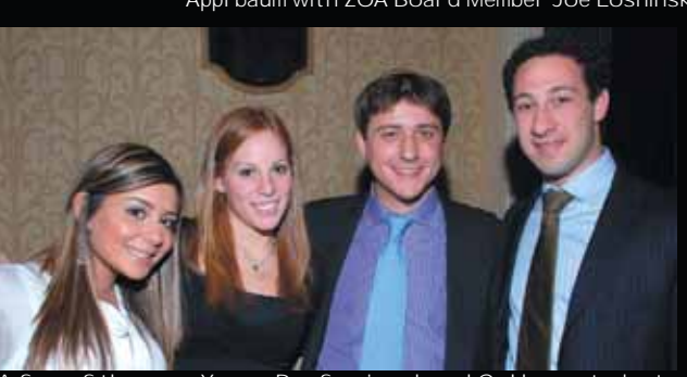
A few of the many Young Professional and College students who attended the dinner