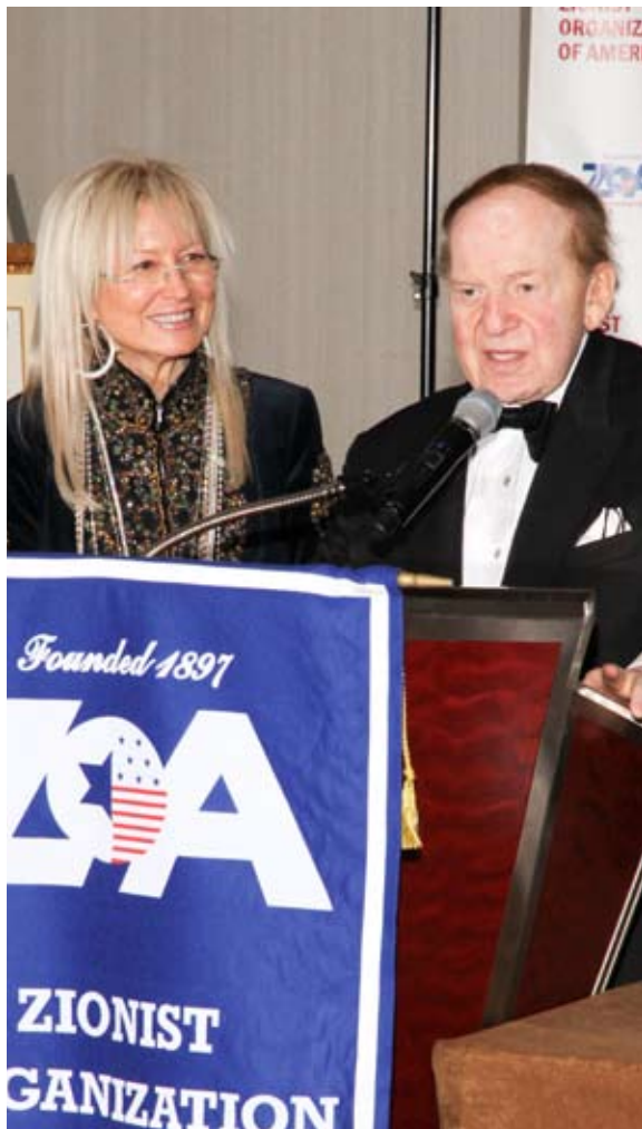
Dr. Miriam Adelson and Sheldon Adelson speak prior to presenting the Adelson Defender of Israel Award to Glenn Beck