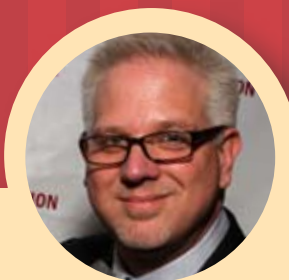
Glenn Beck Media Superstar, TV/Radio Host Author, 6 NY Times Bestsellers Adelson Defender of Israel Award