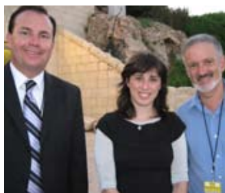
Senator Lee, MK Hotovely and Jeff Daube

The greater Middle East is witnessing an ascendant Islamist Jihadist leadership from Morocco to Pakistan. With Israel's neighborhood roiling, and governments falling or being threatened at a dizzying pace, ZOA Israel notes increasing opposition in Israel to taking "risks for