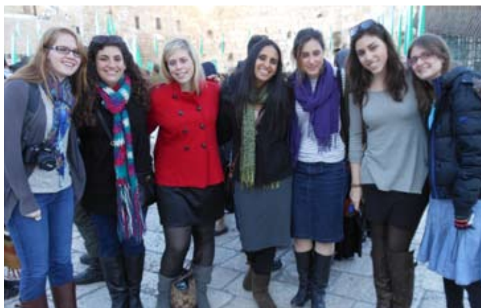
ZOA students in Israel from University of Texas, Pittsburgh University, University of Southern California, UC Berkeley, Queens College, and Drexel University