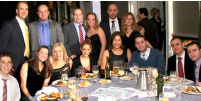
College students involved with ZOA