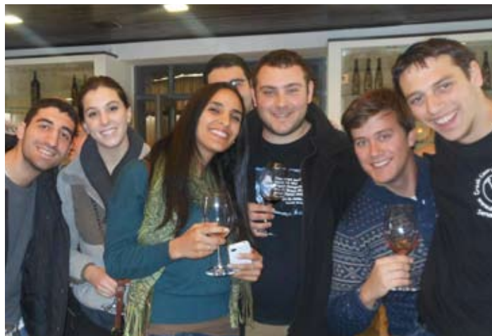
ZOA Students enjoy wine tasting at the Psagot Winery and Binyamin Welcome Center, in the Shomron

Moshe “Boogie” Ya’alon spoke with students about security threats facing Israel. Hearing from such prominent leaders first hand helped solidify students’ own positions on issues that were gradually coming to light during their experience with ZOA.