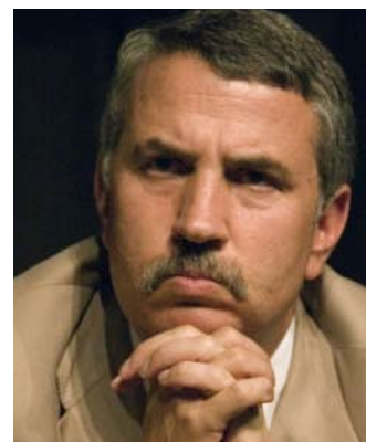
NY Times columnist Thomas Friedman

Thomas Friedman's vicious statement about the Israel lobby is merely the latest in many years of false and hostile anti-Israel statements. In February 2004, for example, Friedman claimed that Israel's leaders were “conspiring” to manipulate President Bush and Vice President Cheney, saying that Israel's then-Prime Minister, “has had George Bush under house arrest in the Oval Office. Mr. Sharon has Mr.