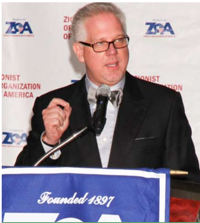
Adelson Defender of Israel Awardee and Media Superstar Glenn Beck addresses the 800-person ZOA Annual Dinner

Ros-Lehtinen, describing her as a “national treasure to every Jew in the U.S.” and describing her legislative efforts opposing U.S. funding of both Mahmoud Abbas’ Palestinian Authority (PA) and the United Nations Relief and Works Agency (UNRWA). Rep. Ros-Lehtinen came to the podium and was greeted with a standing ovation. In her address, Rep. Ros-Lehtinen commenced by saying that she was “proud to be associated for so many years with ZOA.” She spoke of two dinner attendees, residents of the Jewish community of Kedumim in Samaria, stating sarcastically that “they’re an impediment to peace, because they live in the Judean & Samaritan community of Kedumim.” Turning to the Iranian threat, Rep. Ros-Lehtinen said that the Obama Administration’s policy for stopping Iran had been completely ineffective: “all we’ve got is a further three years closer to Iran getting a nuclear bomb.” She called for further U.S. action, including genuinely “crippling sanctions to help bring this regime down ... We passed the sanctions bill [H.R. 1905] targeting Iran’s Central Bank.” Speaking of the U.N. Reform, Transparency and Accountability Act [H.R. 2829], an earlier law which the Congress had passed that cuts funds to UN agencies that raise the states of the Palestinians, Rep. Ros-Lehtinen recounted how the Obama Administration had sought “flexibility” in its application, to which she had