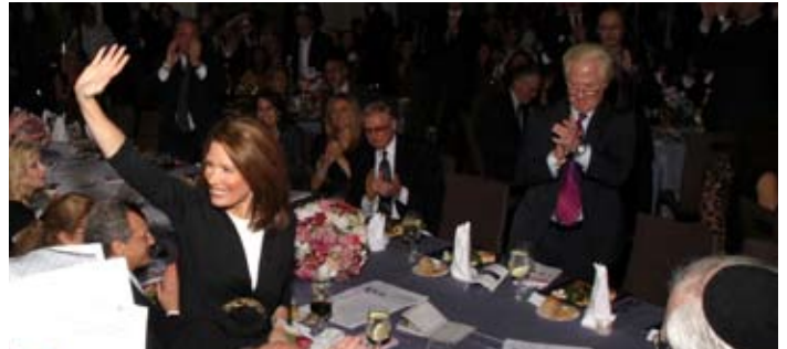
Cong. Michele Bachmann waving to the applauding crowd at the ZOA Gala Dinner