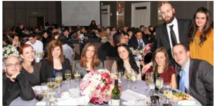
College students enjoy ZOA's Gala Dinner