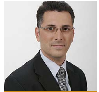
Minister Gideon Saar