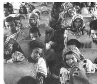
Forgotten Refugees: Middle East and North African Jews