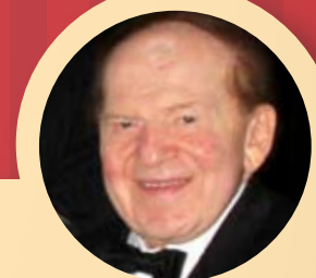
Sheldon Adelson Renowned Entrepreneur & Philanthropist Adelson Defender of Israel Presenter