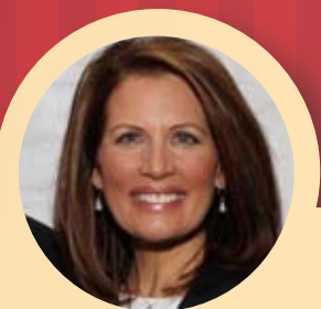
Cong. Michele Bachmann (MN) Presidential Candidate