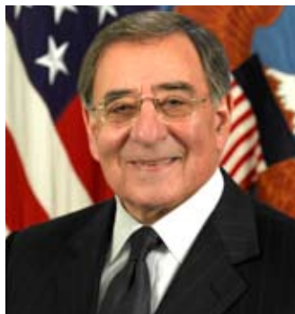
Secretary of Defense Leon Panetta