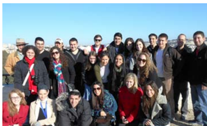
ZOA students pose in front of a backdrop of Jerusalem at the Haas Promenade