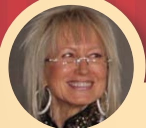
Dr. Miriam Adelson Distinguished Physician Adelson Defender of Israel Presenter