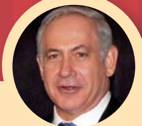
Israeli Prime Minister Benjamin Netanyahu Video Address to ZOA