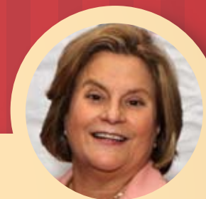
Cong. Ileana Ros-Lehtinen (FL) Chair, House Foreign Affairs Committee Dr. Irving and Cherna Moskowitz Award