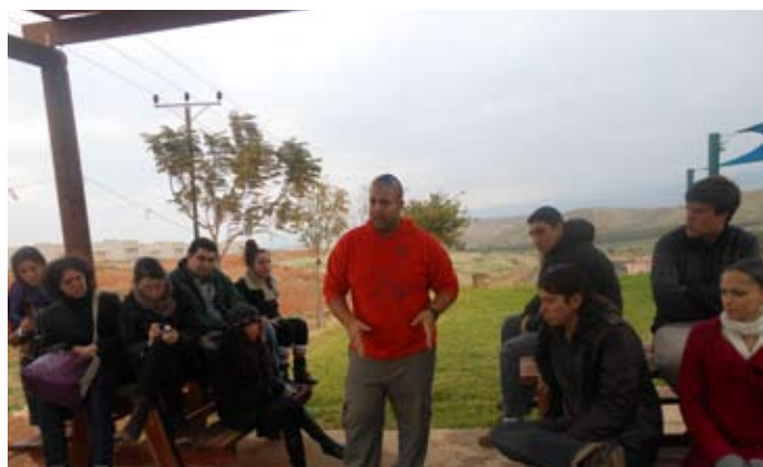
ZOA students hear from local resident of Maskiot while visiting the growing community built by Jewish Gazan refugees