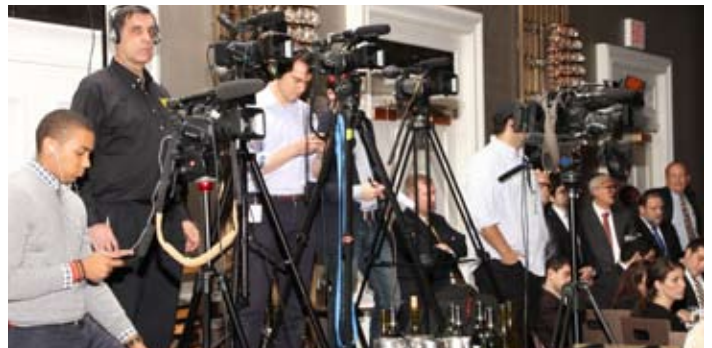
Video crews from TV stations record the ZOA Gala event