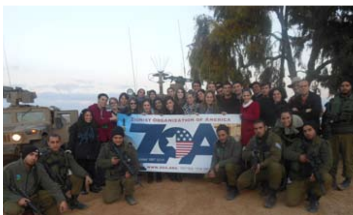
ZOA students posing with Israeli soldiers on the border with Lebanon after delivering chocolate and other snacks