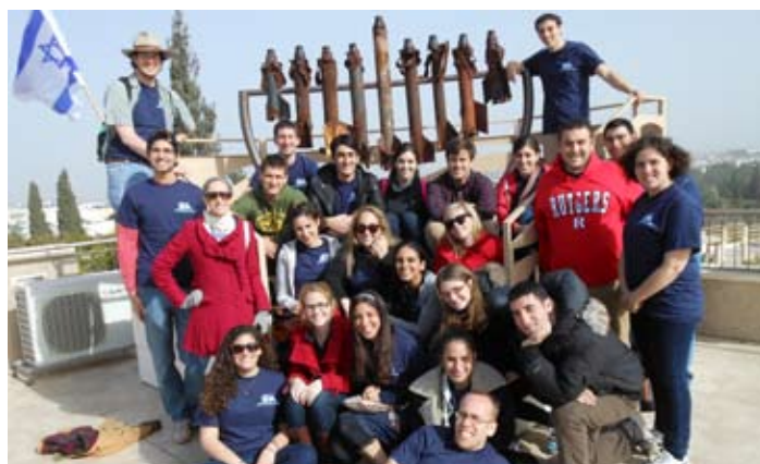
ZOA Israel trip students visit Hesder Yeshiva in Sderot and pose in front of Menorah designed with Kassam rockets

Another major goal of the program was to demonstrate