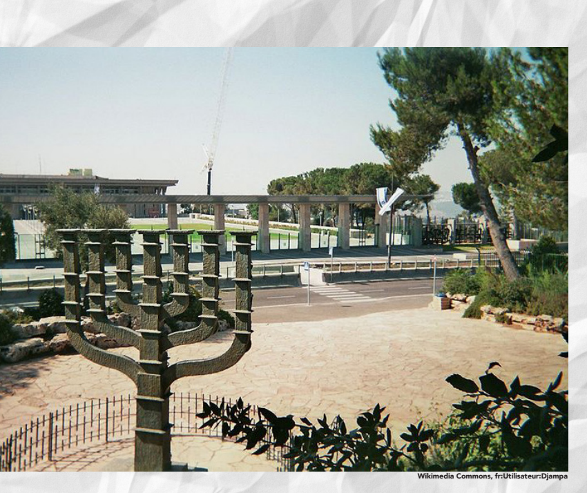
The Knesset Menorah: this monument is an ancient Jewish symbol, located in front of the Knesset, the Israeli paliment building. Jerusalem, Israel. October 17, 2010.