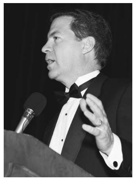
Sen. Sam Brownback (R-Kan.)

From a senator from America's heartland to a frontier mayor from Israel; from a columnist not afraid to point out uncomfortable