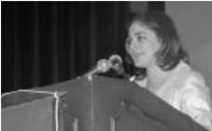
Caroline C. Glick addressing the Dinner attendees