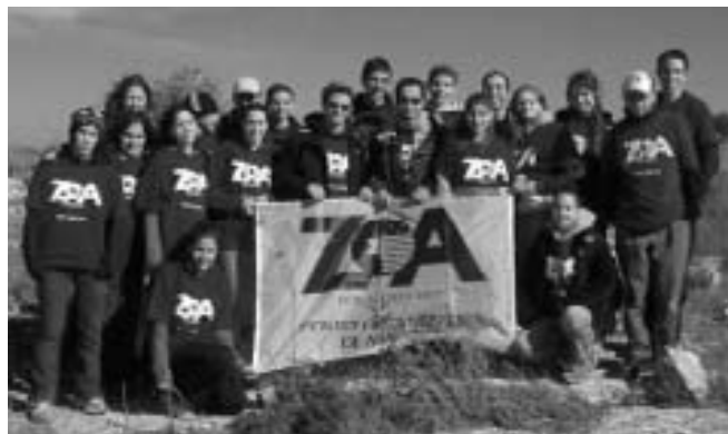
ZOA Student Leadership Mission to Israel, Winter Break 2005-2006. Feature story in the next issue of the ZOA Report.

ZOA maintains this list in strictest confidence, and never gives out your e-mail address! You may cancel any time; instructions will be at the bottom of each e-mail!