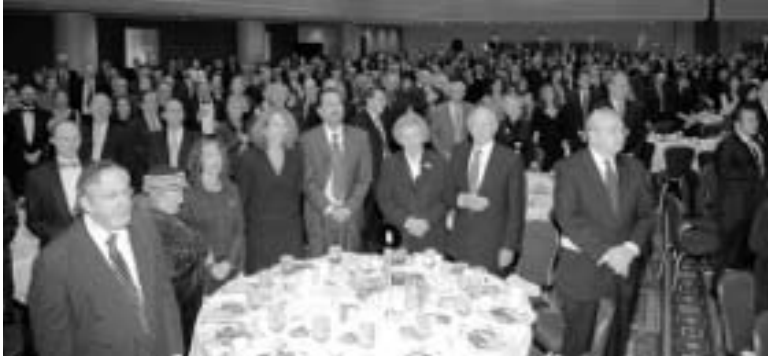
Inside the Marriott ballroom: this year's attendance at 1000+ was the highest ever.

Glick spoke of the current dangers facing an Israel led by old leaders "basing their policies on fantasy rather than reality ... The fantasy of Oslo was that Arabs want peace with Israel. The fantasy of Oslo was not replaced by a strategy for victory based on reality, but with a new strategy based on a new fantasy ... Sharon's new fantasy of disengagement is that while it is true that the Arab world in general and the Palestinians in particular have no interest in living at peace with Israel, Israel can deal with their hatred by unilaterally disengaging from the Middle East and holing up behind walls and barricades, turning on the internet and becoming immediately transported to a world where we will be safe. The disengagement from geographical and strategic reality that Sharon is advancing is in many ways more dangerous than the fantasy of Oslo..."