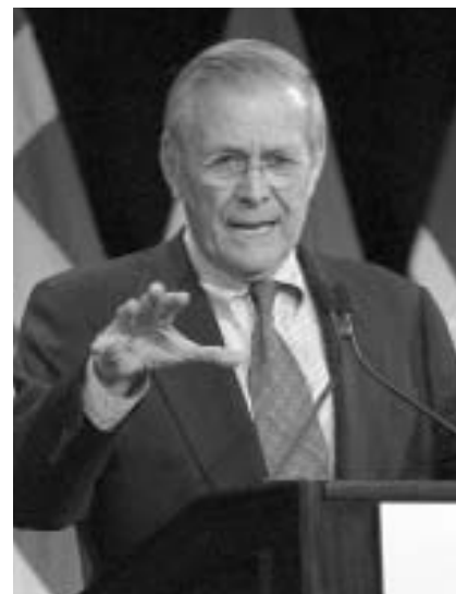
US Secretary of Defense Donald Rumsfeld